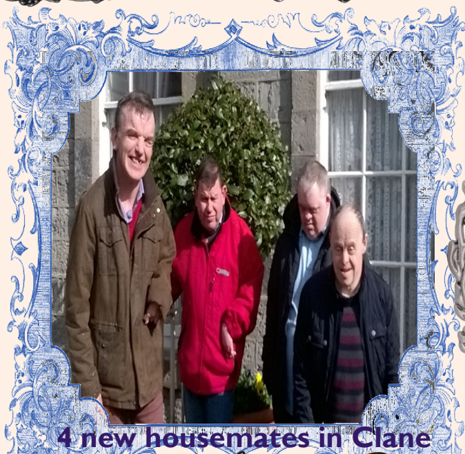
4 new housemates in Clane