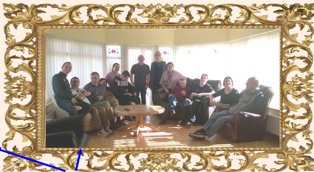
Some new tenants on Co Louth