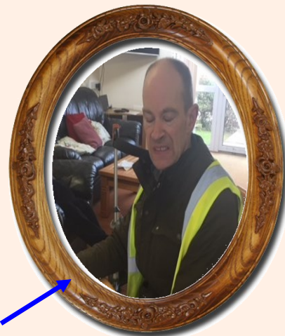
Some internal transfers & new tenant in Co Dublin